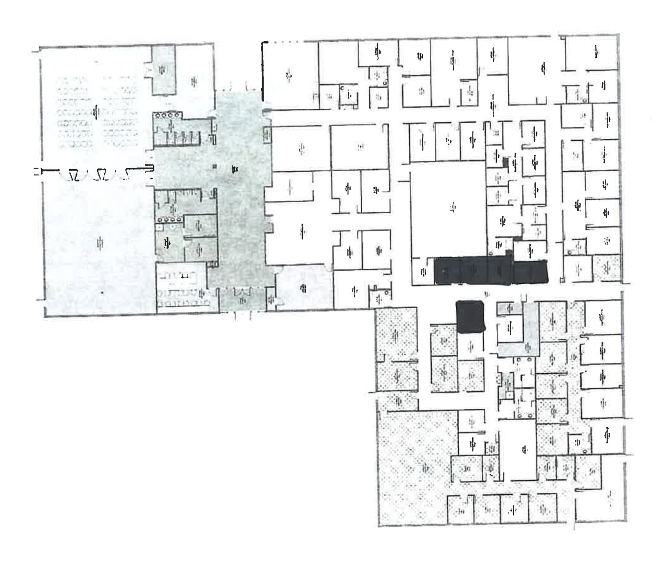
EXHIBIT "A" Page 1 of 2